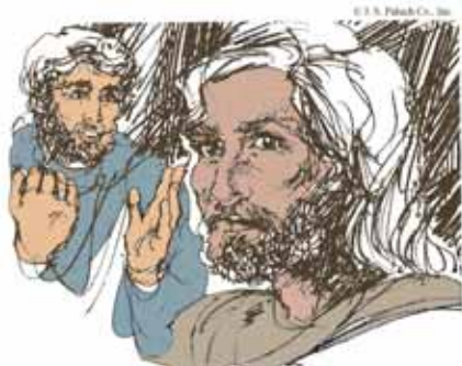
Jesus rebuked Peter: "Get behind me, Satan!"